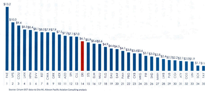
ANNUAL UNITED REVENUE EACH WAY-CLOSED STATIONS In millions of dollars for YE4Q2019

Since April 2020, United Airlines has closed 35 stations, amongst those, ERI ranked #14 in terms of revenue for United